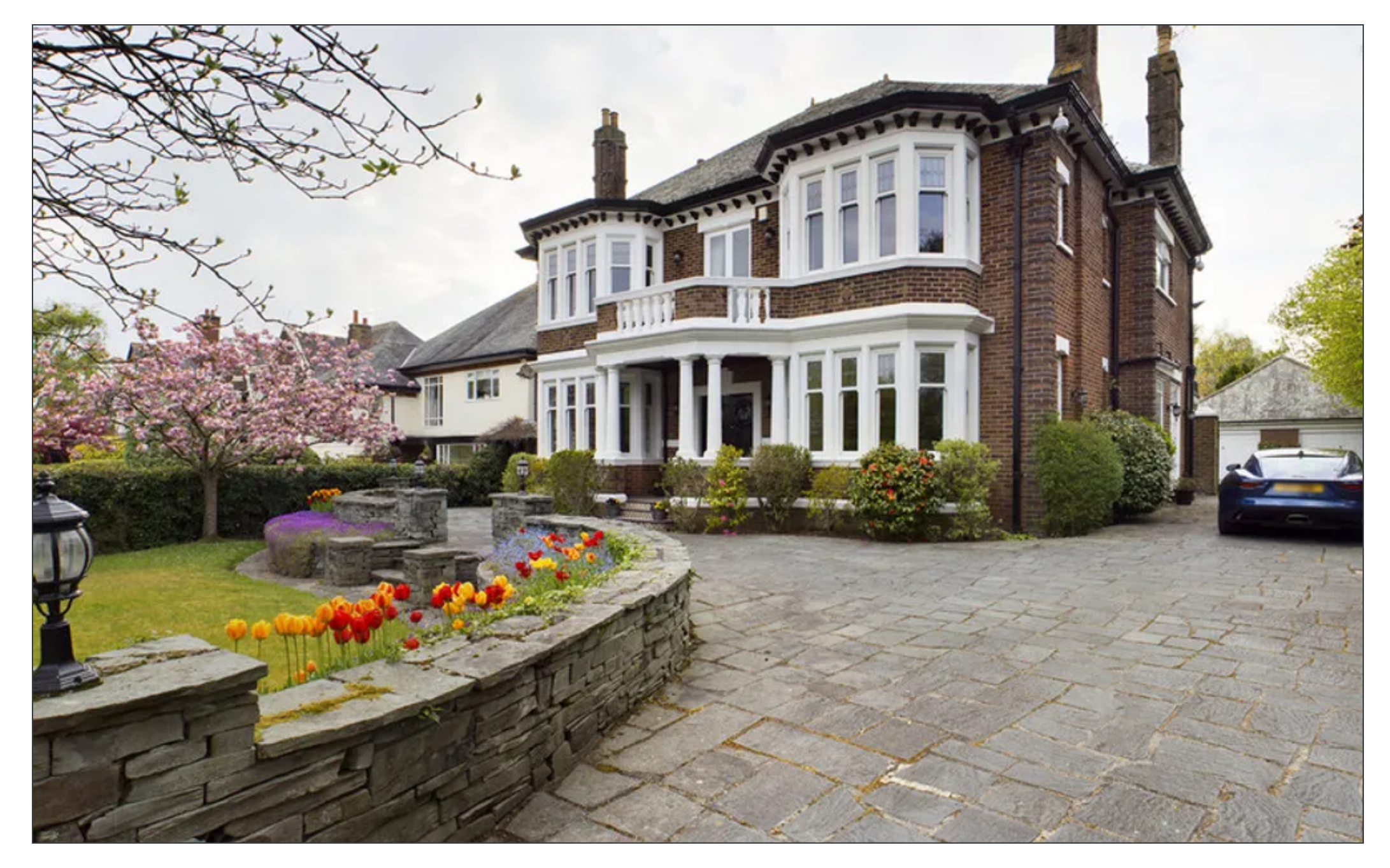
North Park Drive, Blackpool, FY3 £875,000